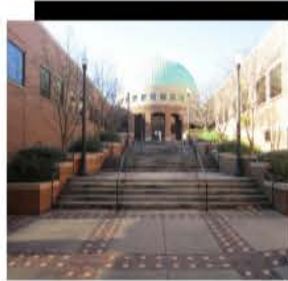
Accessibility of the built environment